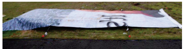
Example of proper storage